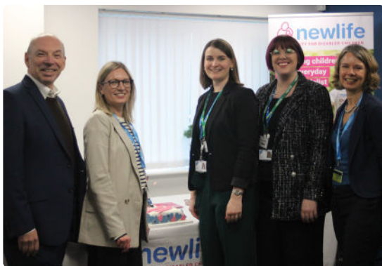
Both Newlife and Motability representatives were honouring International Wheelchair Day.

This is exactly the kind of work we wanted to support when we launched our new grant portfolio last year, and we hope to fund further charities and organisations to help deliver the greatest impact to as many disabled people as possible."